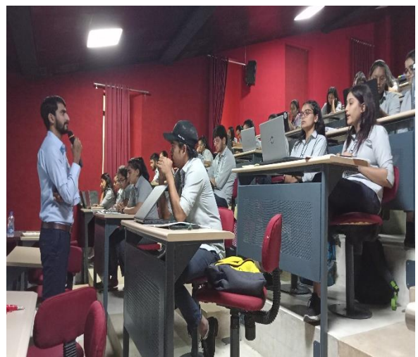
Students engaged in data search exercise and response sharing