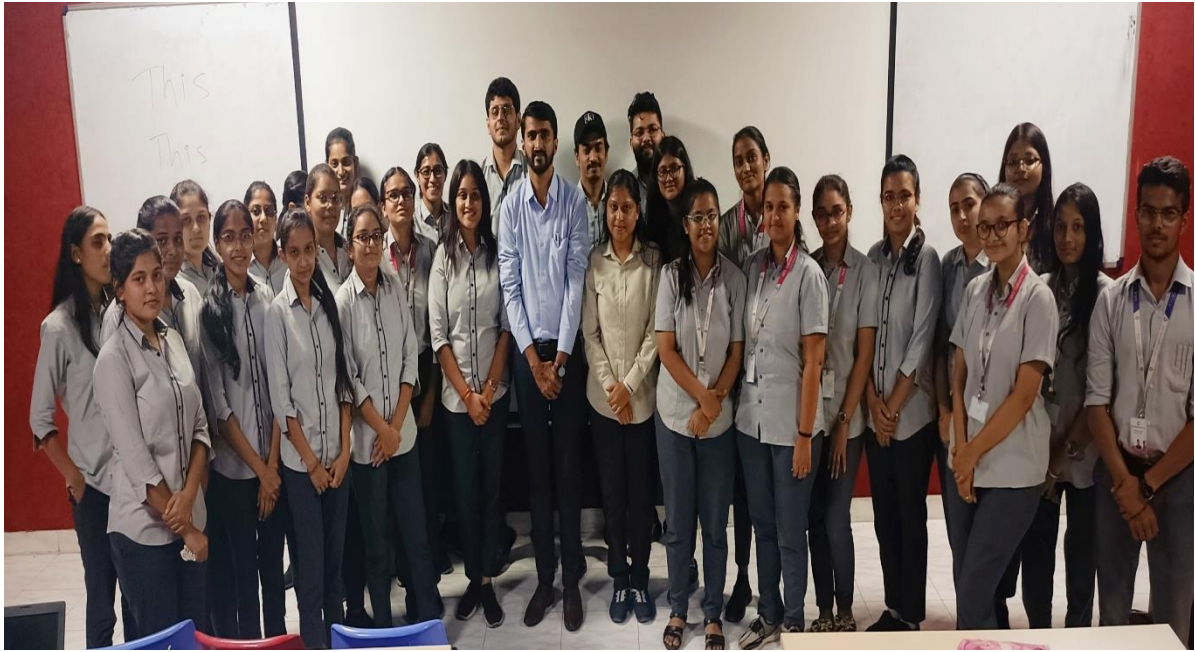
Group photo with the workshop expert