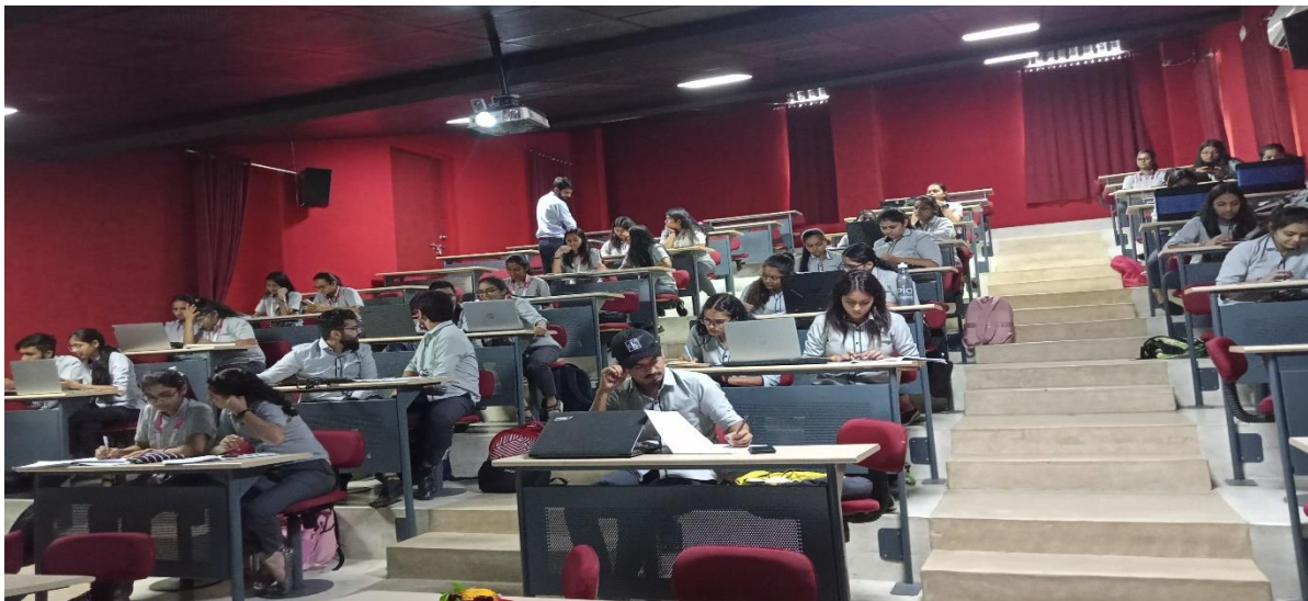
Students actively participating in the workshop